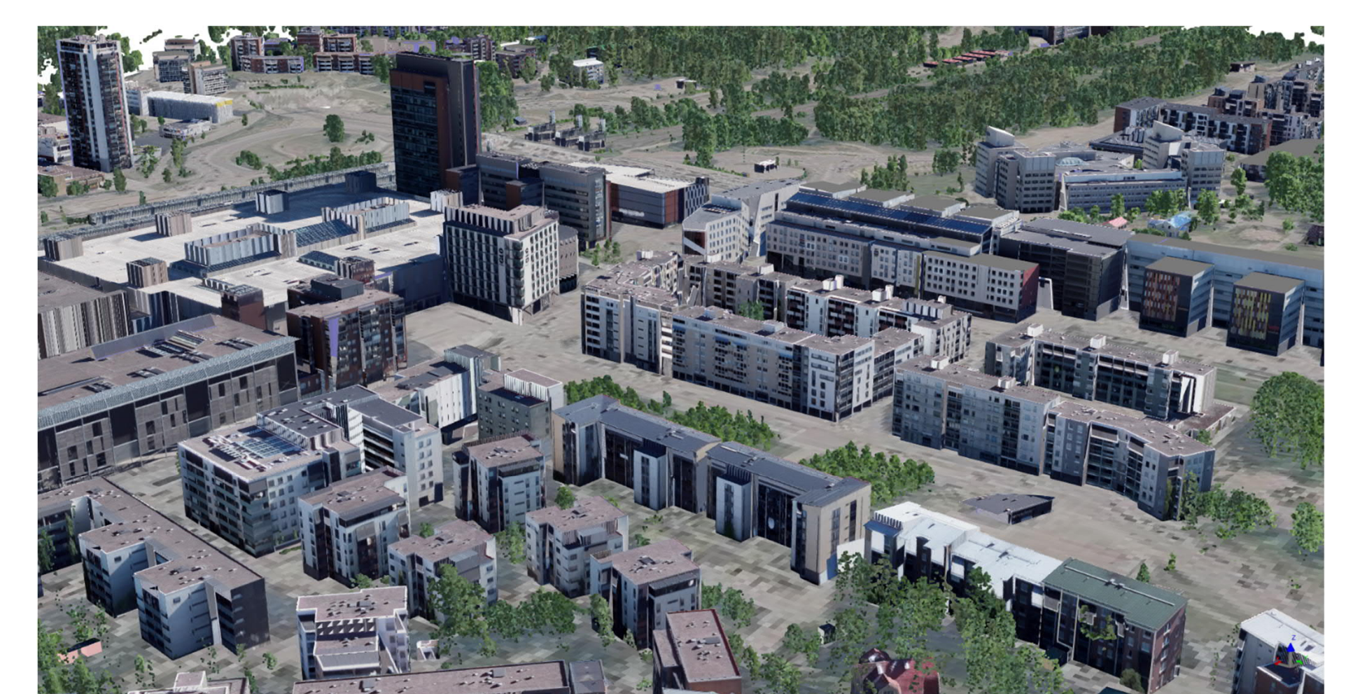
3D model from Leppävaara (image: city of Espoo)