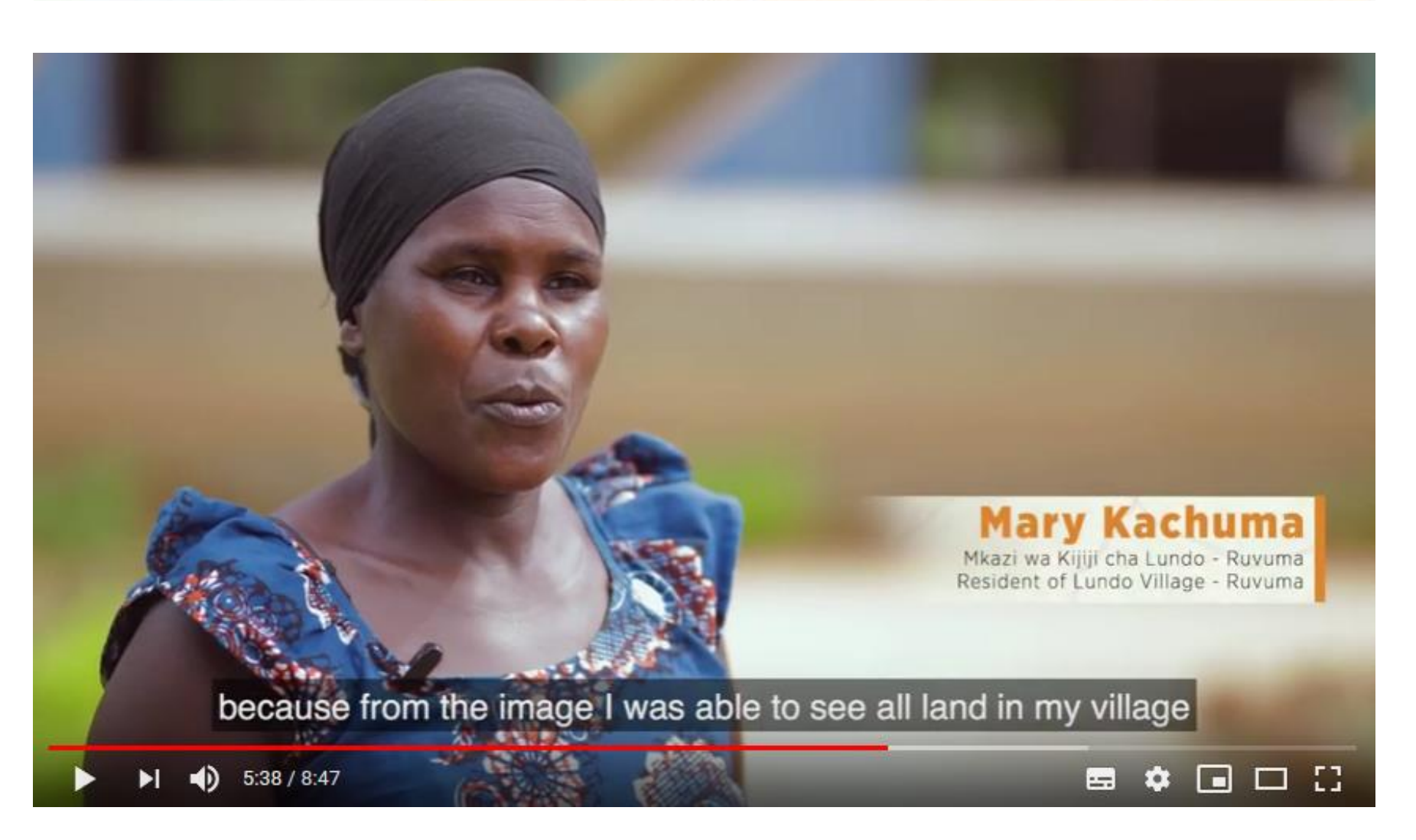
Figure 2. In order to promote the developed methods, short videos have been produced. In the videos, practitioners and participants tell about the benefits of the participatory planning methods and explain how they can be used. Videos by Studio 19.